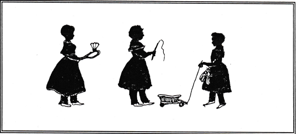
Silhouettes of groups of children in a Garden, done by E Whittle, c. 1836