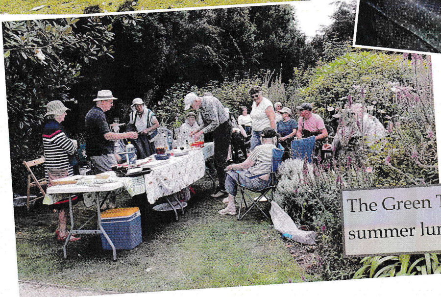
The Green Team summer lunch