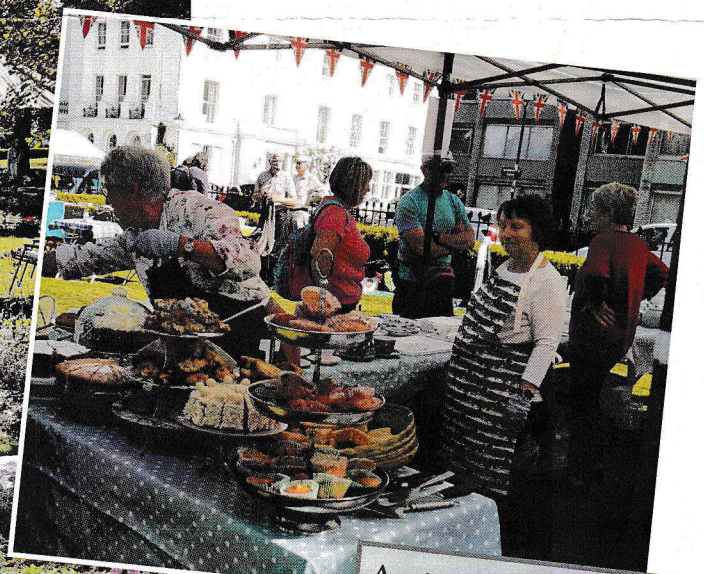
A stunning array of cakes at the plant sale