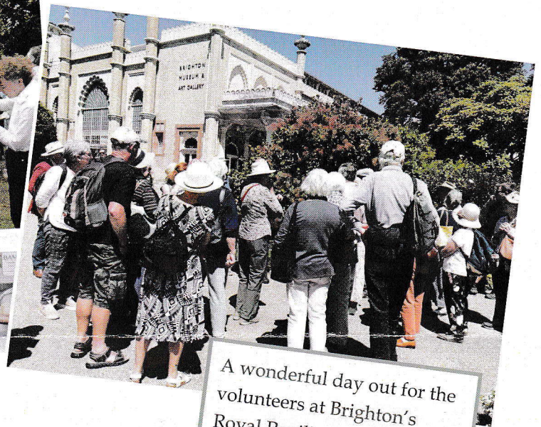
A wonderful day out for the volunteers at Brighton's Royal Pavilion & Garden