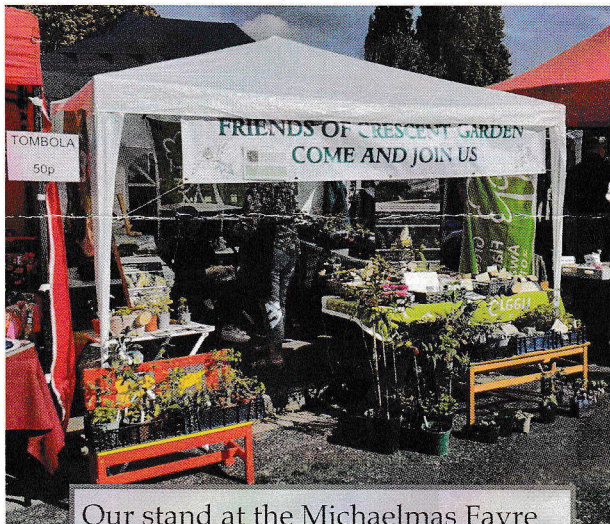
Our stand at the Michaelmas Fayre

Apart from the usual leaf collecting and bay-shoot cutting at this time of year, many of the shrubs have been pruned including the roses which are done every autumn/winter. Several of the roses are still flowering, particularly the Stanwell Perpetual – still looking beautiful.