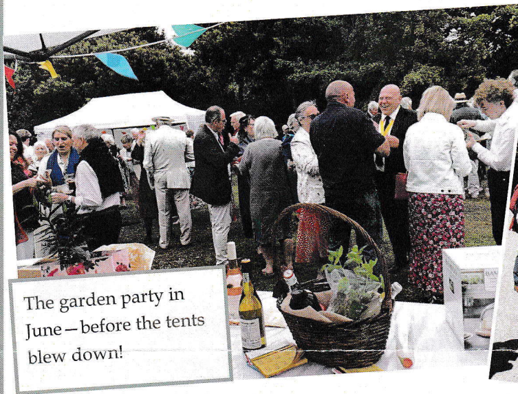
The garden party in June – before the tents blew down!