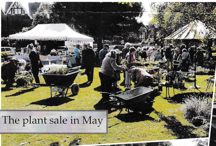
The plant sale in May

Do come to the garden on any Wednesday morning and see what the volunteers are doing - probably something very similar to what is described above!