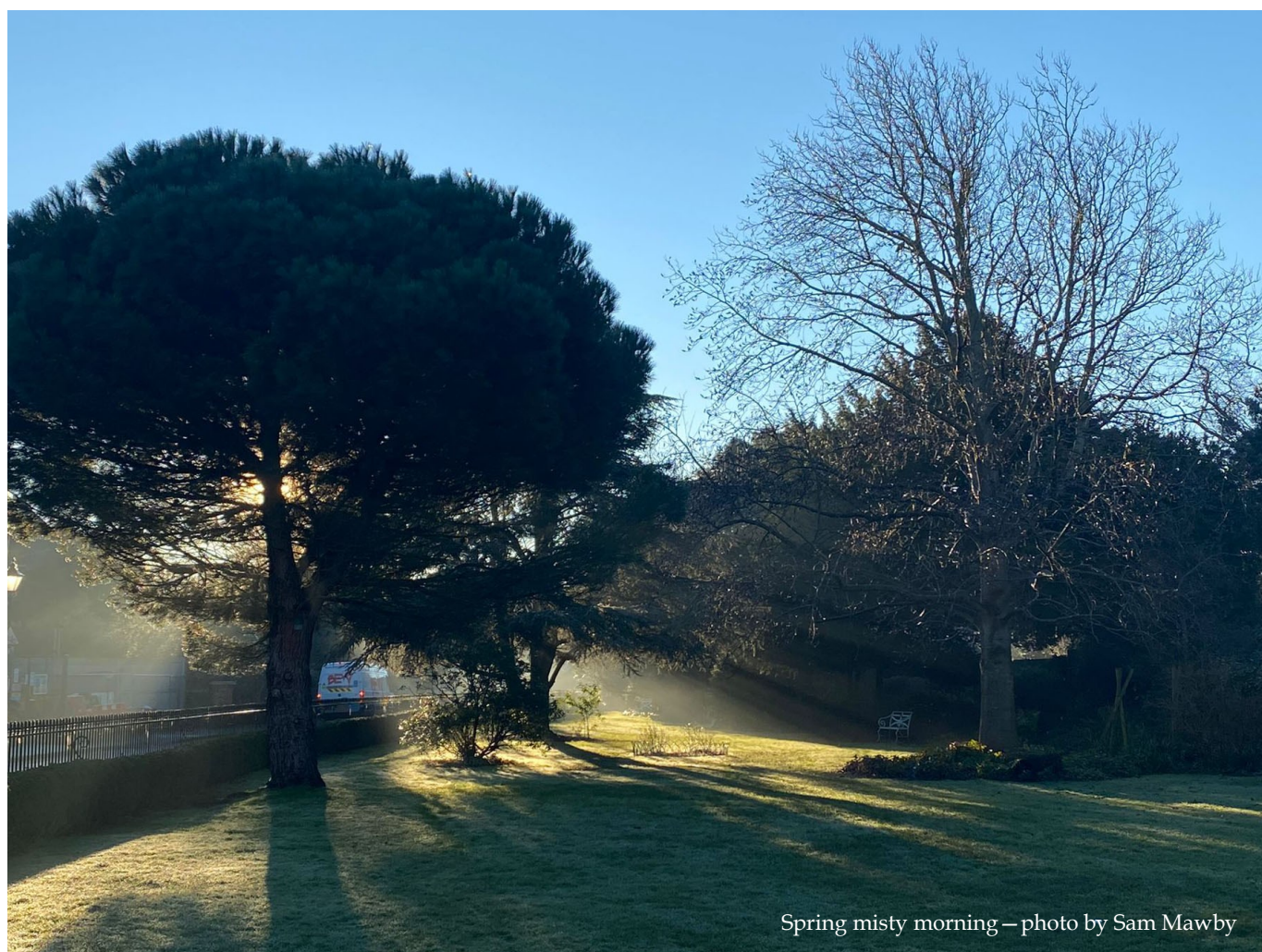
Spring misty morning