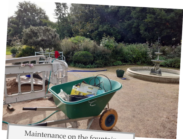
Maintenance on the fountain