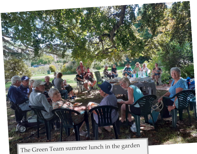
The Green Team summer lunch in the garden