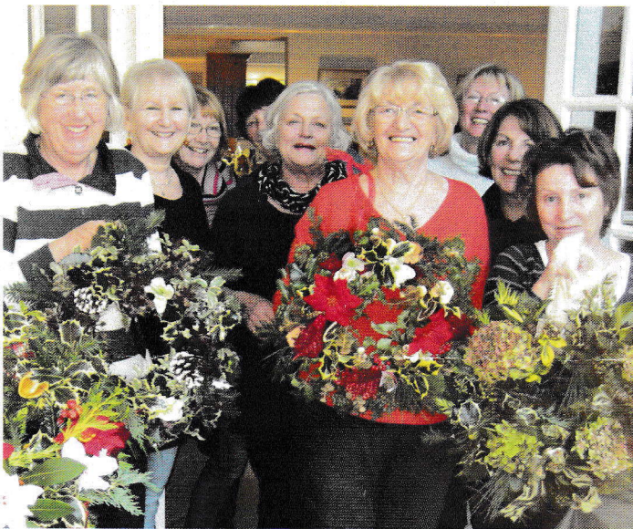
The Green Team enjoy a day making Christmas Wreaths