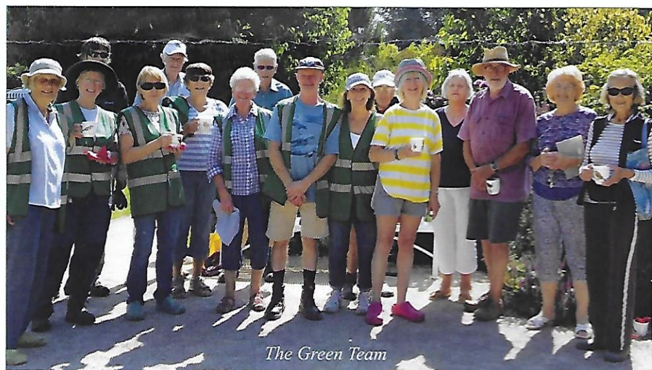
The Green Team

This year we have suffered a lot of trouble with snail and slug damage.