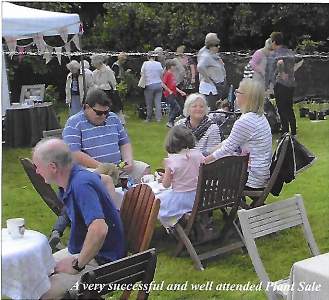
A very successful and well attended Plant Sale