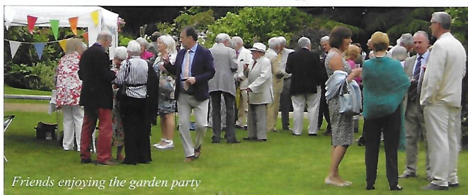
Friends enjoying the garden party

Once again the Garden Party in June was well attended and was very much enjoyed by many Friends. The Brass band, that has now become a delightful fixture, the flowing Pimms and the quite exceptional finger-food made for a wonderful evening. I so appreciate all the support from the committee and the Friends who make this event possible, it is certainly the highlight of the summer social calendar!