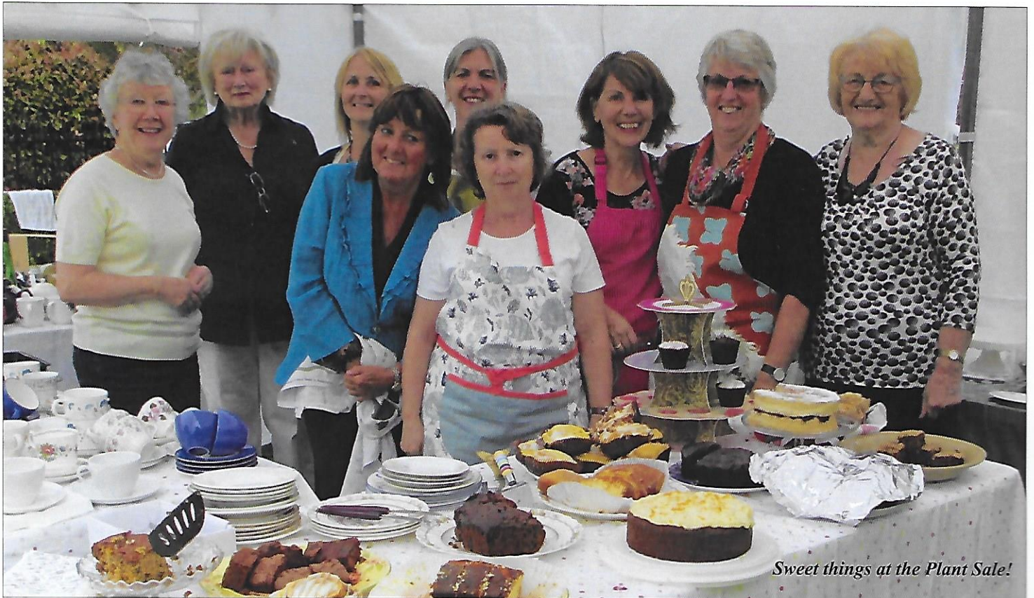
Sweet things at the Plant Sale!