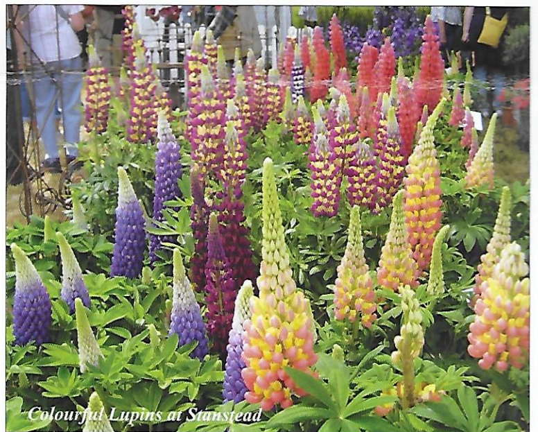
Colourful Lupins at Stanstead