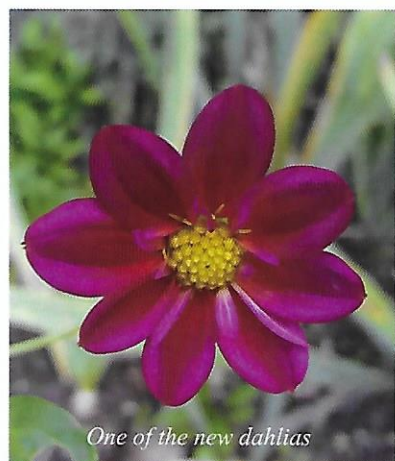
One of the new dahlias

The new species dahlias which Paul Hattin grew from seed have been planted for Autumn colour but unfortunately they were decimated by slugs and snails, despite our use of natural slug pellets. We will try again next year but will harden off the young plants a little further before planting out.