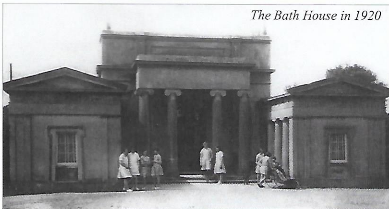
The Bath House in 1920

The year 1945 brought the end of World War II and the beginning of a twenty-year period lasting until the mid-1960s during which time much of Gosport's heritage was unceremoniously demolished, most of it for no good reason. Older Gosportians will remember many of the old buildings with affection. One such edifice was the reading room and bath house complex which once straddled the area where the main gate to the garden is today and was, of course, an integral and important feature of Cruickshank and