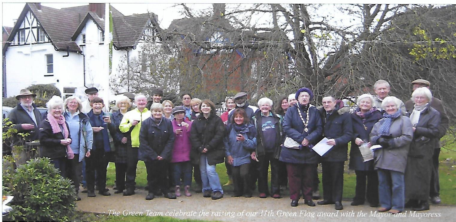
The Green Team celebrate the raising of our 11th Green Flag award with the Mayor and Mayoress