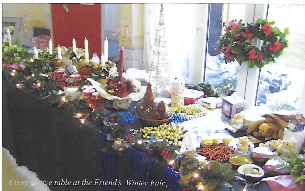
A very festive table at the Friend's' Winter Fair