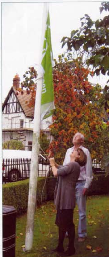
Raising the Flag

Planting a regency garden requires a huge amount of research and reading. Some of us have acquired a large library detailing old plant species. These books are often found in charity shops although my 1835 edition of John Claudius Loudon's 'Encyclopaedia of Gardening' came from San Francisco: via the internet naturally! Robert Louis Stevenson said: "If a man love the labour of any trade, quite apart from any question of success or fame, the gods have called him".