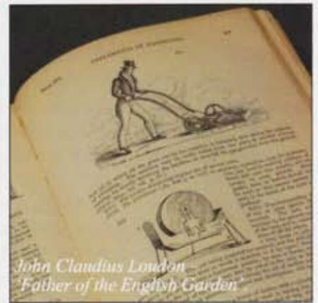
John Claudius Loudon "Father of the English Garden"

Of the inspirational figures that have influenced the 'Renaissance' of Crescent Garden, John Claudius Loudon 1783-1843, is surely at the forefront.