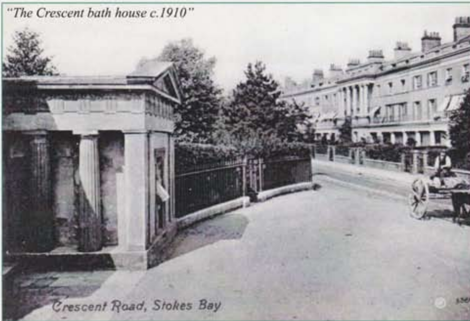
Crescent Road, Stokes Bay

Vivien Rolf carried us all along with her energy, enthusiasm and scholarship. She talked for over an hour but the time just flew past. We were transported to a time in history when bath houses and plunge pools were the fashion of the day, if a trifle risqué at times! Most were a delightful addition to stately homes, though all were unique in their way. Some were tidal, if near to the sea, while others were fed from freezing springs. It