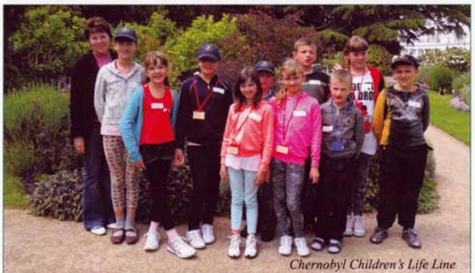
Chernobyl Children's Life Line